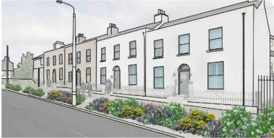
Spring Garden Street